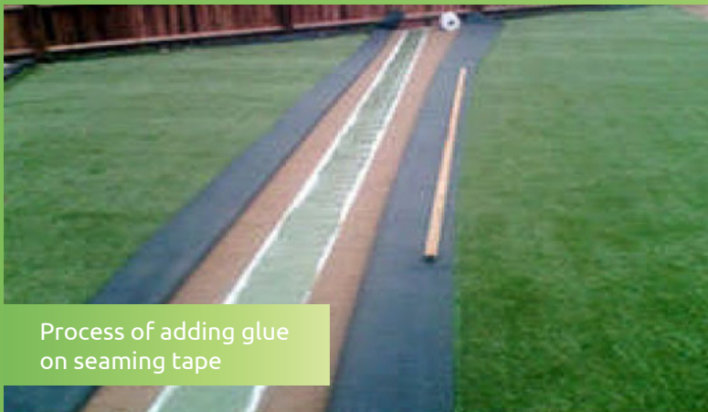
Process of adding glue on seaming tape