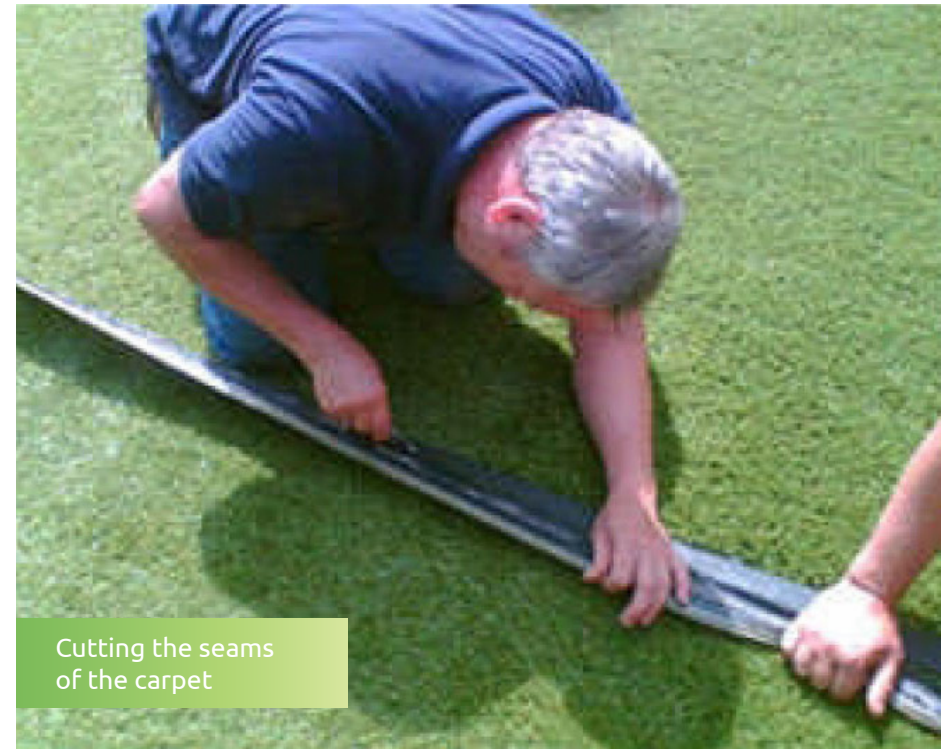
Cutting the seams of the carpet