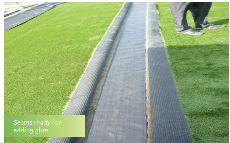
Seams ready for adding glue