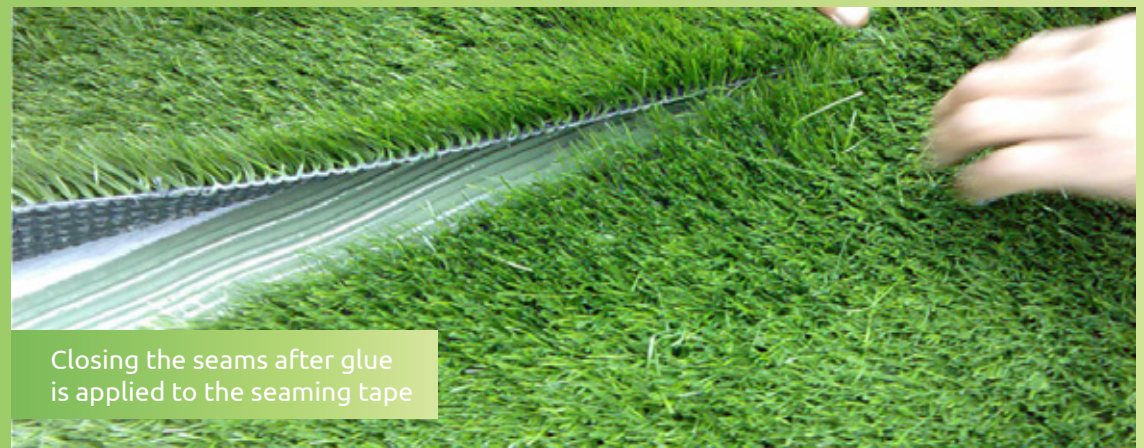
Closing the seams after glue is applied to the seaming tape